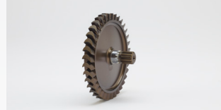
Solid Aluminum Turbine