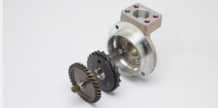
Rear Serviceable Motor

Introducing the Ingersoll Rand ST150 Series mid-range turbine engine starter. Packing a powerful 47 HP in a solid aluminum turbine motor, this new family of air starters is based on the patented next generation technology from the rugged, long lasting, easy to service, high performing and efficient ST1000 turbine starter. Built to withstand the toughest environmental and working conditions – combining robust features and flexibility to deliver reliable, heavy-duty starting in a wide variety of industrial, oil and gas, marine, power generation, rail, and mining applications.